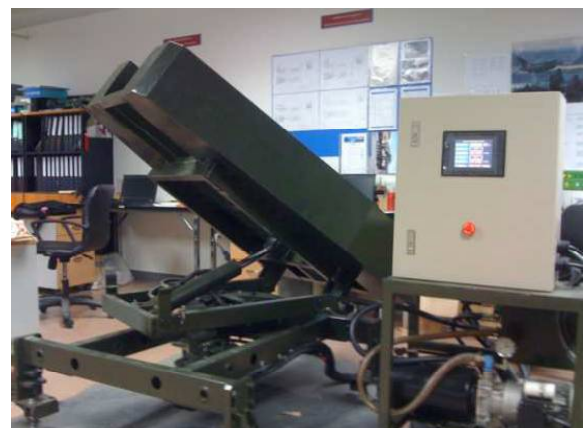
Fig. 2 Rocket platform.

Failure Mode and Effect Analysis: FMEA has been applied to use in various processes such as a product design process has been used this technique to design and develop the electric wire [1]. The process of reducing waste used it in producing water piping of the radiator in the car