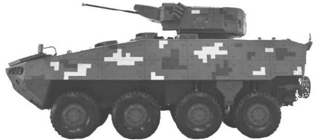
Figure 1 Military Vehicle

Abstract —Engine-bay-cooling system is an important part of the vehicle engine, maintaining the operating temperature. One of the factor determines heat-transfer efficiency of the system is the inflow air velocity which is controlled by the grille shape. A specific military vehicle designed for amphibious use intakes cooling air from the top of the vehicle via high performance exhaust fan. The grille and engine bay are modelled and analyzed by computational fluid dynamics to determine the suitable grille shape. The simulation has shown that vehicle speed has insignificant effect on the amount of air intake, and the grille blade setting at 45-degree gives the highest flow velocity into the engine bay.